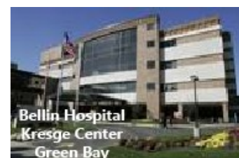
Bellin Hospital Kresge Center Green Bay Bellin Hospital Kresge Center 744 S. Webster St., Green Bay

To all of our GI colleagues! Join us for our 1 st satellite conference. Brochures and registration forms were emailed last week. Please share with your friends, members and non-members. The program will be broadcast live from Milwaukee and shown in Green