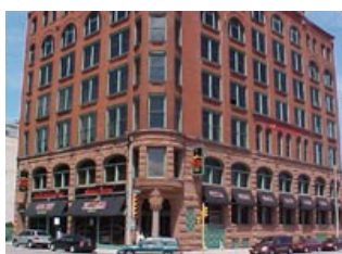
Joey Buona's Restaurant 500 N. Water St., Milwaukee,

It is a 'first' for WSGNA... a satellite conference!